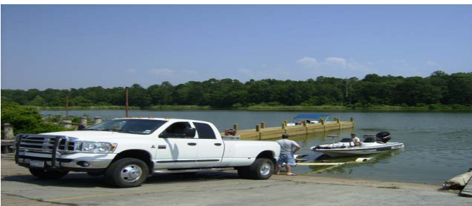
May New Ramp