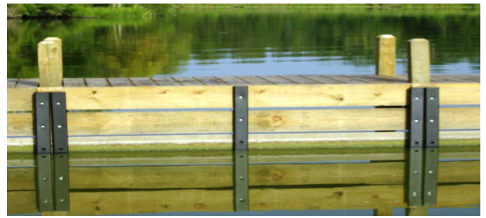
August Bumpers At Ramp