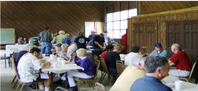
March VFD Fish Fry