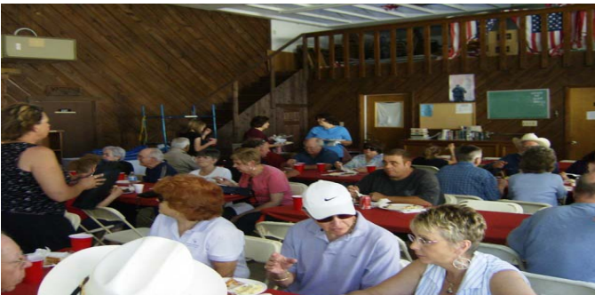
April Spring Fling