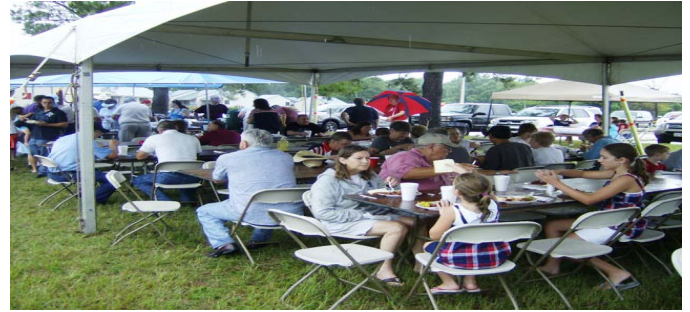
July 4th Celebration