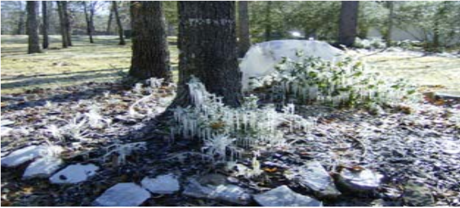
January Cold & Ice