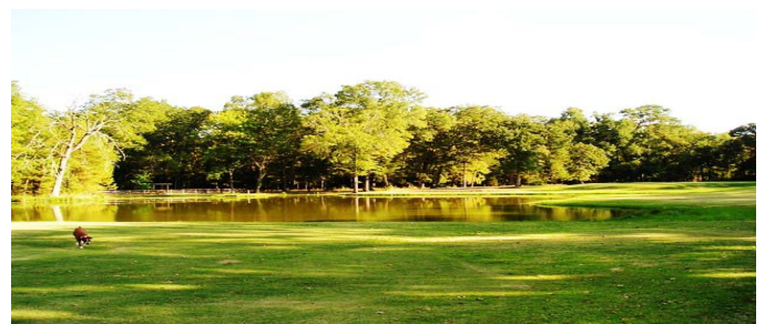
November Golf Course