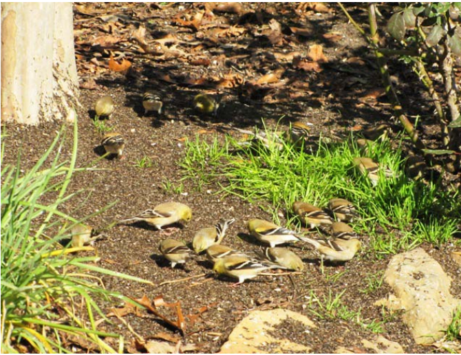
Lots of Room Down Here