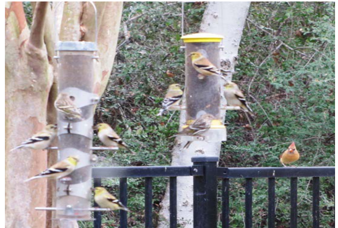
Cardnals Need Food Too