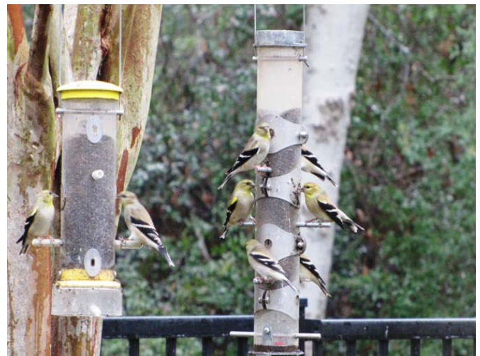
The Right Side is Better