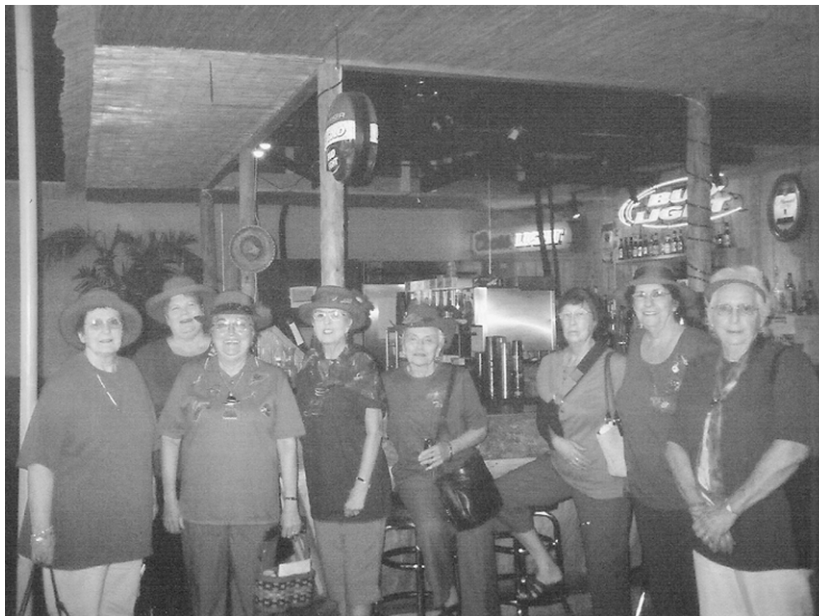
Waterwood Red Hat "Sisters"

In July of 2007, we hosted a luau at the WCC with 120 people attending. The husbands and/or the significant others were judges of the hula dance contest and a participated in the limbo. We had a blast.