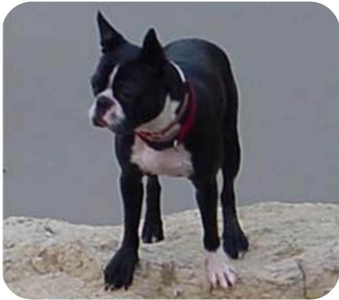
Rascal Russell looks out over Lake Livingston from a rock next to his home.