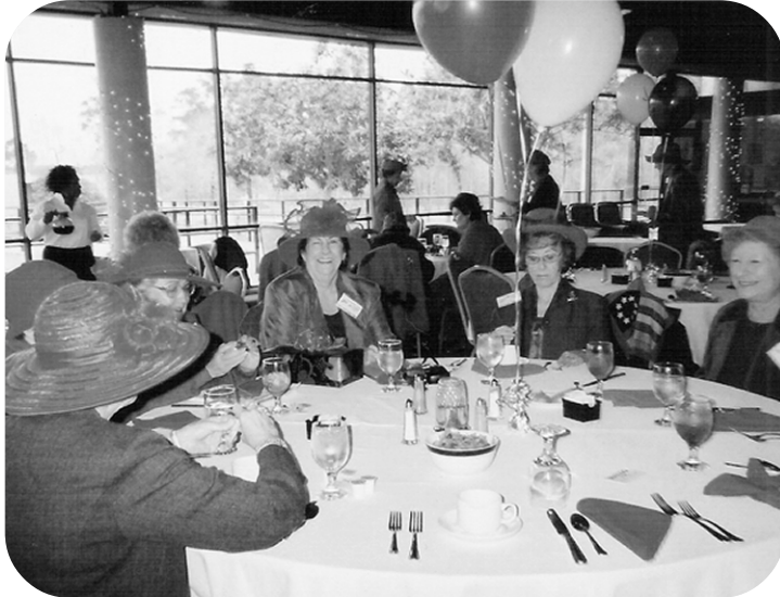
Red Hat Society of Waterwood Members Enjoy a Meal at the Club