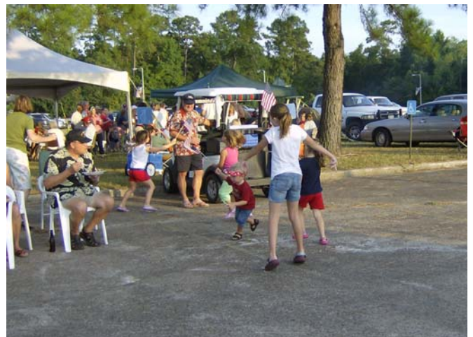
ROCKING AND ROLLING