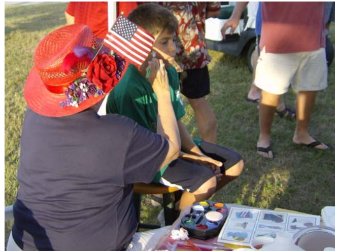
FACE PAINTING BY WANDA