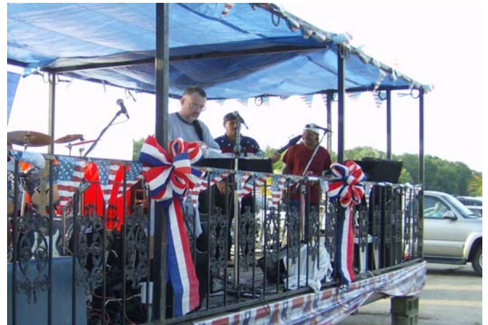
THE BAND PLAYED ON