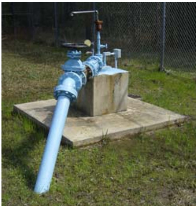
Waterwood MUD Well #1 Pump

The two water wells that currently serve Waterwood were drilled near the present location of our water storage tank off of FM 980. Number 1 well is located adjacent to the storage facility and Number 2 well is about 600 yards south of the area. The wells have over 250 feet of casing and are powered by 135 gallon per minute (gpm) pumps. Pump #1 is used once per week in the winter and 3 days per week in the summer months.