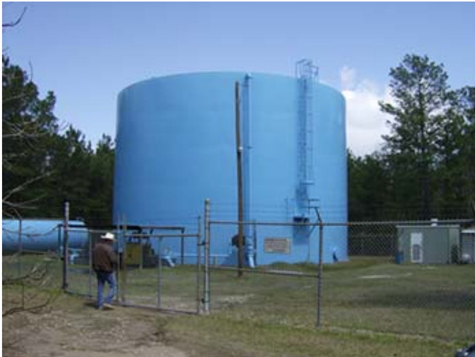
Waterwood MUD Storage Tank