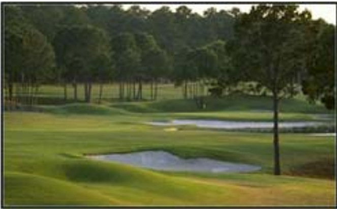
The 4th Hole at Waterwood National