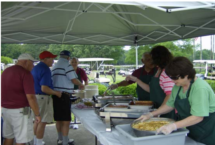
The Great Servers