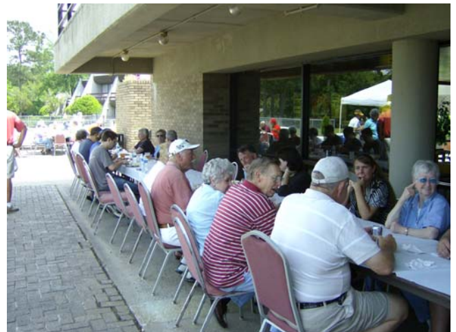
Isn't the Shade Great