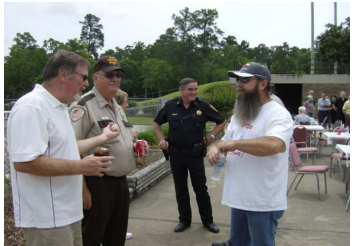
My Fish Was Bigger Than Yours