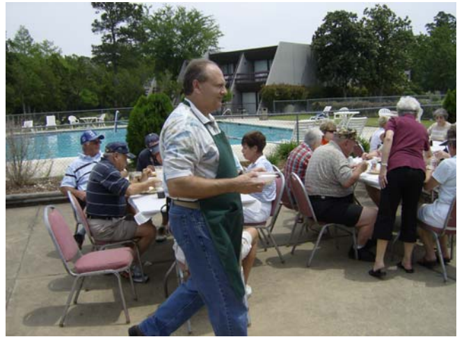
Donnie Delivers Desert