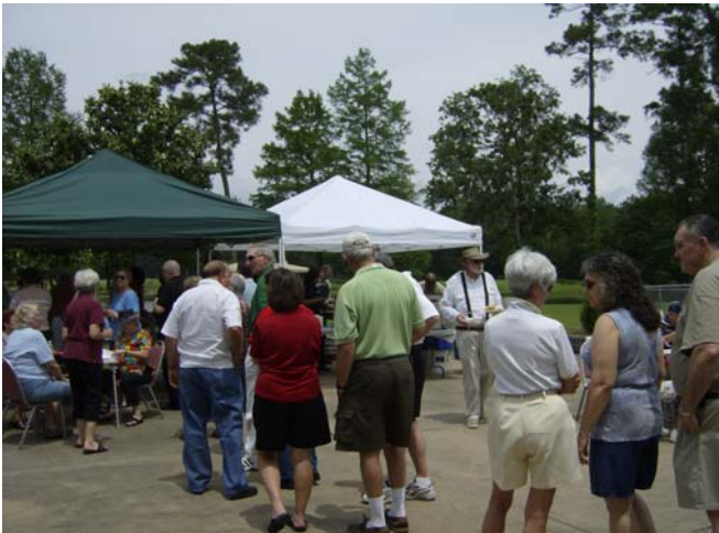
Here Comes the Folks