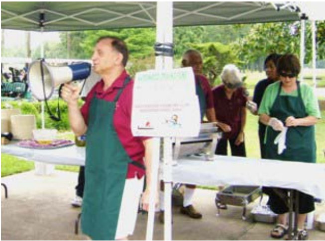
Come and Get It!!