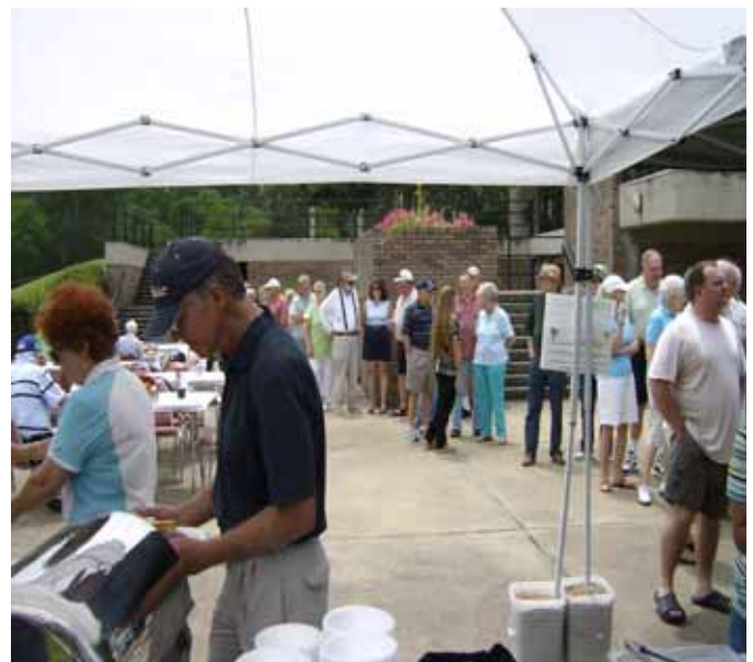
GETTING READY TO EAT AT THE SPRING FLING