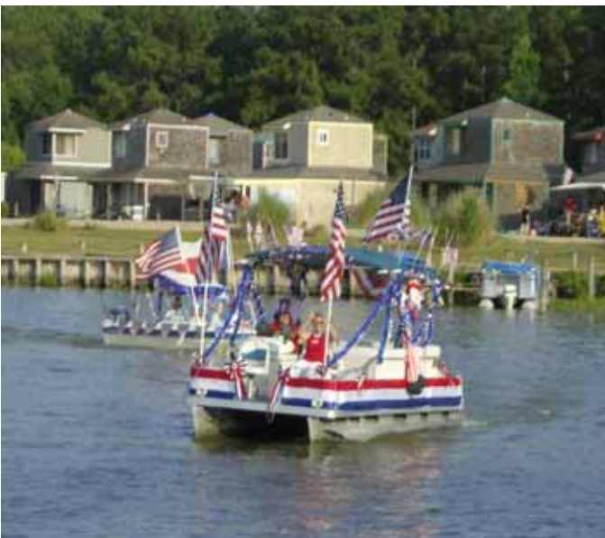
BOAT PARADE DURING THE FOURTH OF JULY CELEBRATION